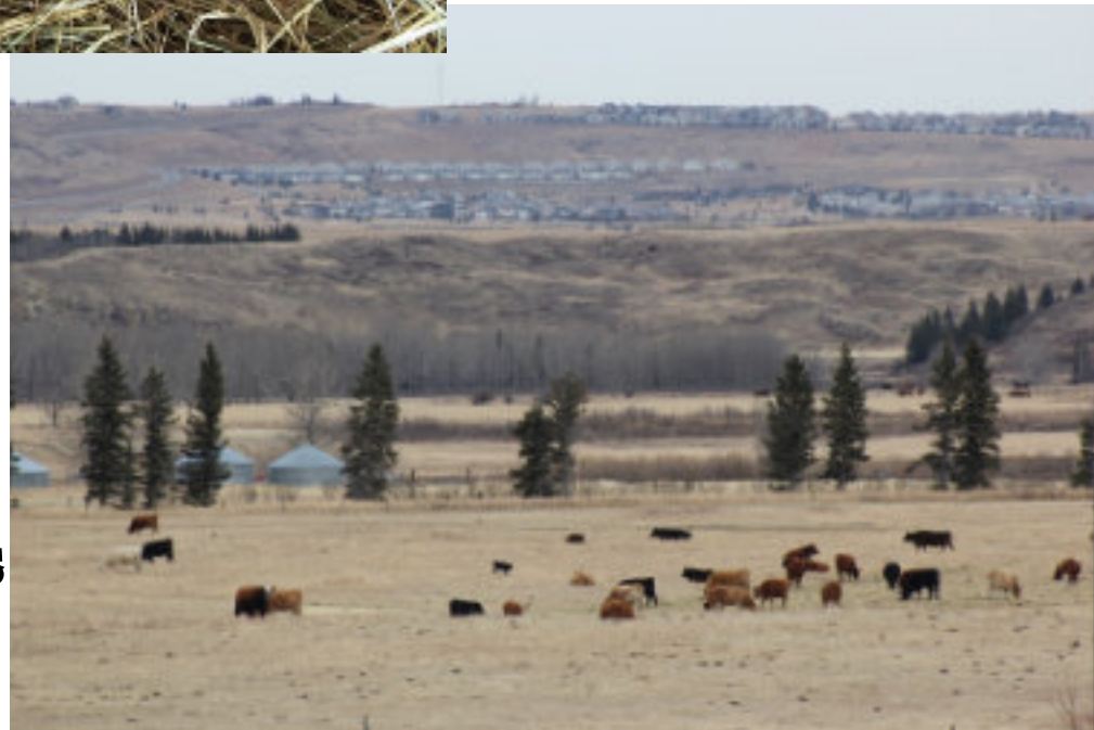
FEEDING THE WORLD BY LORI-ANNE EKLUND-FORBES